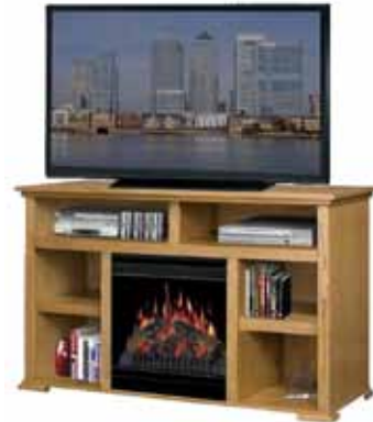
Lucas Media Center